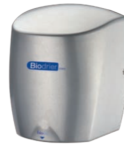
Biodrier BioLite Silver BJ09S