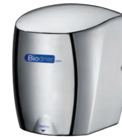
Biodrier BioLite Chrome BJ09C