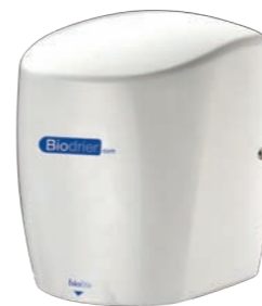
Biodrier BioLite White BJ09W

Using 90% less energy than conventional dryers this revolutionary concept puts hand dryers firmly on the agenda with its green credentials. It's vital statistics make it an obvious choice for facilities and purchasing managers looking for a cost-effective long term solution.